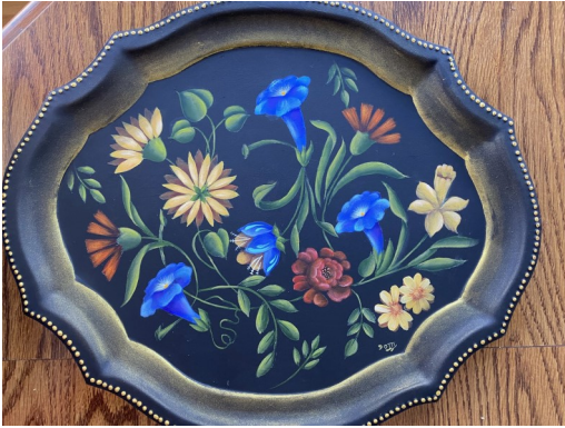
Rosemary West design painted by Dotty Pullo, CDA