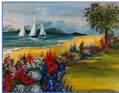
Beth Wagner April 9th Zoom