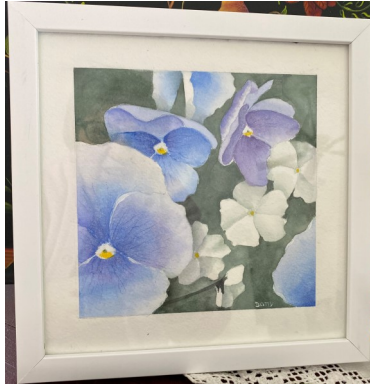
"Pansies" Original Watercolor By Dotty Pullo, CDA 6 x 6