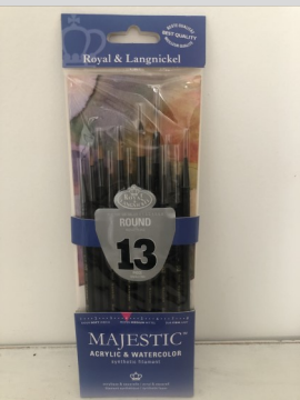
February 13 pc Royal & Langnickel Round Brush Set