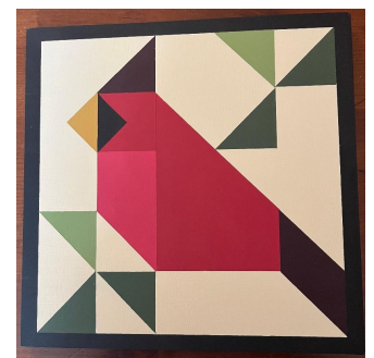
One of my finished cardinals