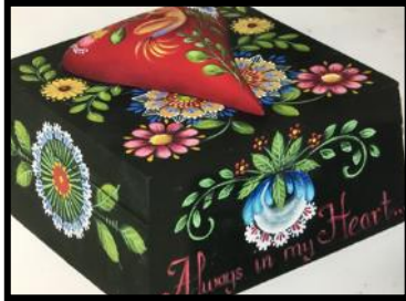
Box top is 5"