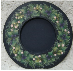
Winter Wreath Candleholder