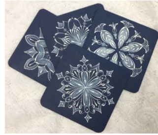
Snow Flake Coasters